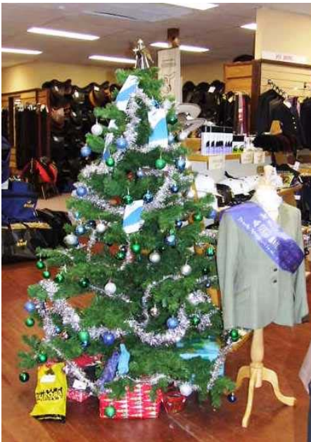
Maddington Angel Tree