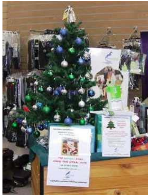
Midland Angel Tree

Once again, the Christmas Angel Tree Appeal was a huge success. A full report will appear in the next edition of 'Wingmail', along with details of the winners of the great prizes: